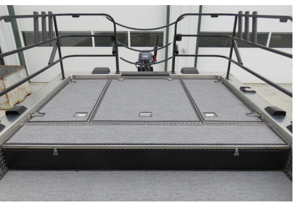
Often Imitated, Never Duplicated Nobody Knows Aluminum Jet Boats and Rivers Like Bentz Boats