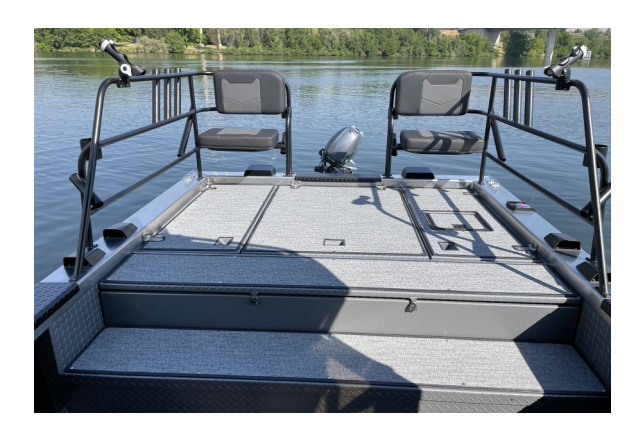
Often Imitated, Never Duplicated Nobody Knows Aluminum Jet Boats and Rivers Like Bentz Boats