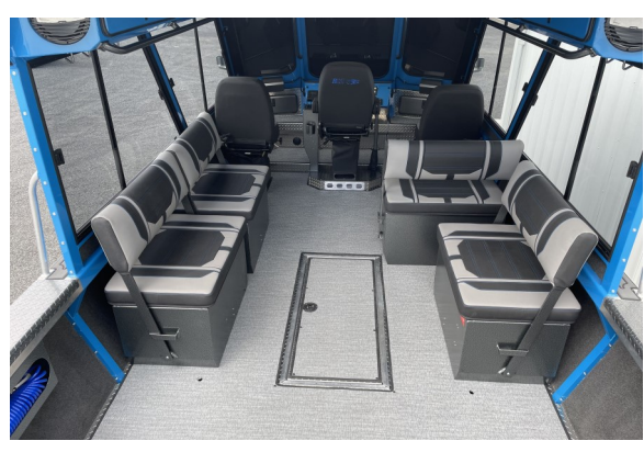
Often Imitated, Never Duplicated Nobody Knows Aluminum Jet Boats and Rivers Like Bentz Boats