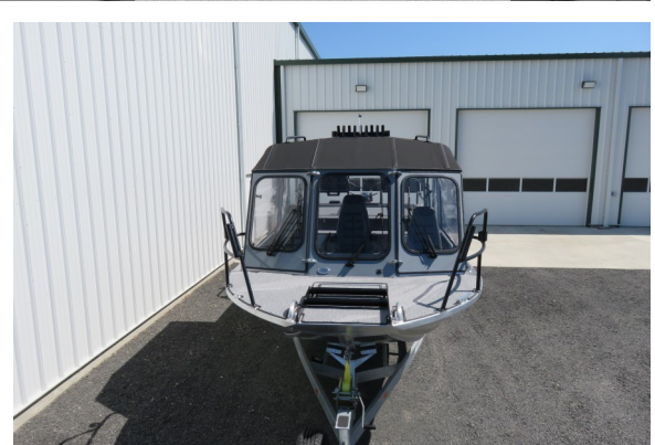
Often Imitated, Never Duplicated Nobody Knows Aluminum Jet Boats and Rivers Like Bentz Boats