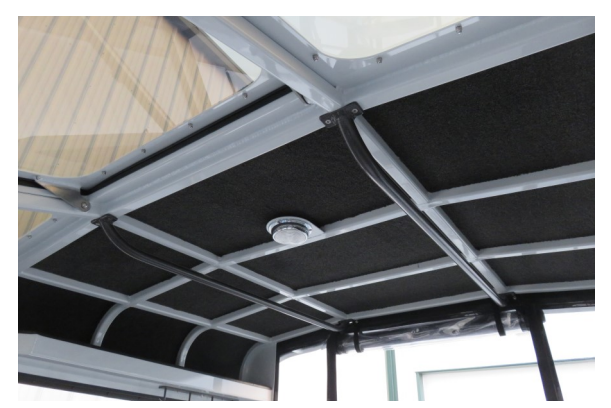
Often Imitated, Never Duplicated Nobody Knows Aluminum Jet Boats and Rivers Like Bentz Boats